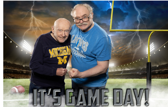
Clausen Manor residents show off their game day spirit for their favorite teams!