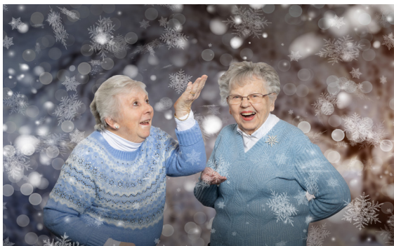
Fox Manor residents have some winter fun!