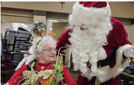
Santa visits with Clausen Manor residents at their annual Christmas party.

Throughout the winter months, Lourdes Senior Community undergoes a serene transformation. Snow softly blankets the tree branches, the sunsets over Scott Lake paint the sky in soft pastels, and our residents turn indoors, enjoying the warmth of hot chocolate and cozy fireplaces. The energy becomes relaxed and serene as we patiently await the return of spring.