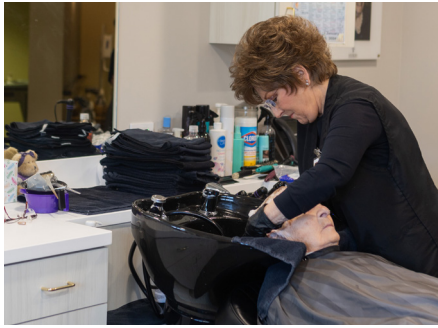
Mendelson resident enjoys hair styling in new salon!