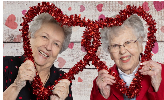
Fox Manor residents have some Valentine's Day fun.