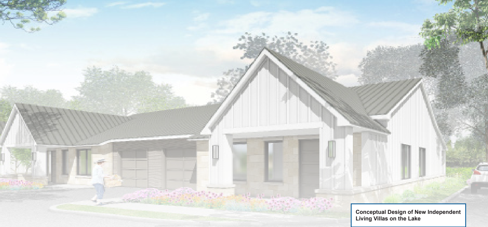
Conceptual Design of New Independent Living Villas on the Lake